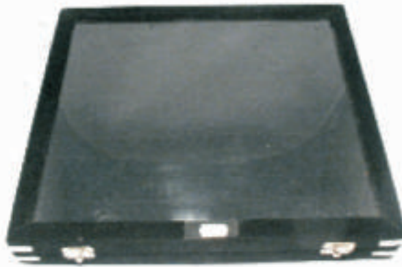
TT - 8033 (HEIGHT - 2") (15" X 13" sq) FINGER RING BOX WITH LID (VELVET)