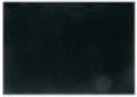
VELVET DISPLY BOARD TT - 9227 - (6"X7.5")